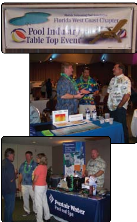
Florida West Coast Chapter's Pool Industry Tabletop in October.