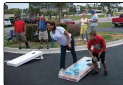
The Charlotte Harbor Chapter held a series of cornhole tournaments.