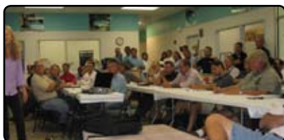
The Broward Chapter offered a CE course in October.

the Board to be involved, just show up for a Chapter meeting! The pool industry is a community and FSPA Chapters are a great way to meet with your community. Events are held to benefit you and many great speakers have informed members on many different issues.