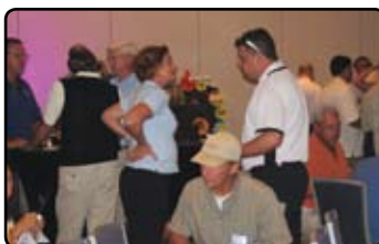
The Tampa Bay Chapter held an energy tabletop event.