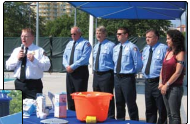
Many of Florida Safe Pool's community partners are Fire Rescue departments.