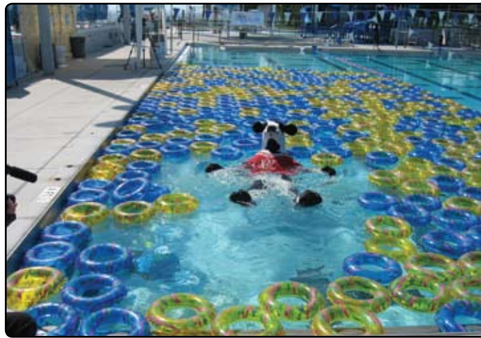
The Chick-Fil-A cow took a dip to cool off at the Florida Safe Pools media event. Florida Safe Pools is a water safety campaign established by Florida Suncoast Safe Kids Coalition led by All Children's Hospital. They are currently focused on Tampa Bay and surrounding areas with the hope of going statewide.

For additional information about any of the events or meetings listed in the Chapter News, please contact the Executive Director listed at the top of each Chapter's News. Event meeting and information can also be found in Chapter newsletters sent to members and available at local distributors.