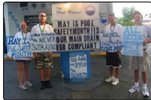
Central Florida Chapter member company, The Pool Pleaser ; encouraging pool safety during National Water Safety Month.