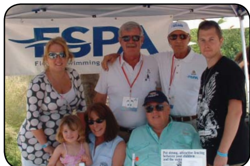
Safety Day Northeast Florida Chapter

Don't miss our next Chapter meetings. June 5, "Chapter 489 Prohibitions and Penalties" (CILB course #0010148, 1 hour, FSPA d/b/a FSPA CILB providership #0000917),