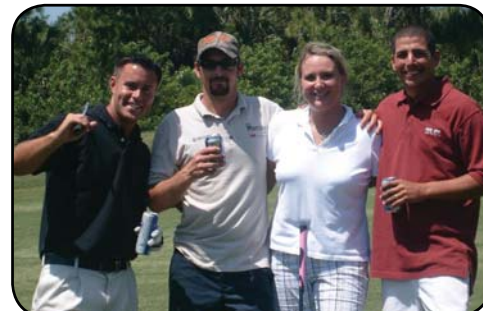
Charlotte Harbor Chapter's Annual Golf Tournament

The next Chapter Board of Directors meeting will be held on June 25 beginning at 4:30 p.m. The location will be sent to board members.