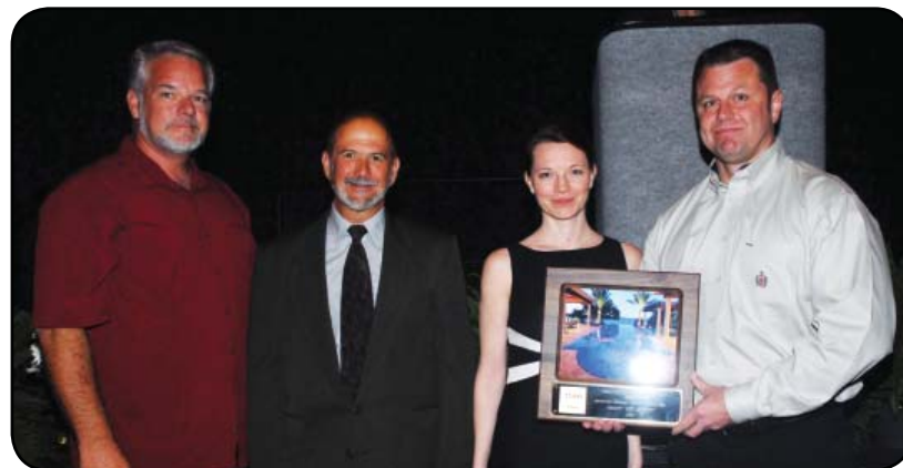
Best in Show at the Design Awards, Southern Pool Designs