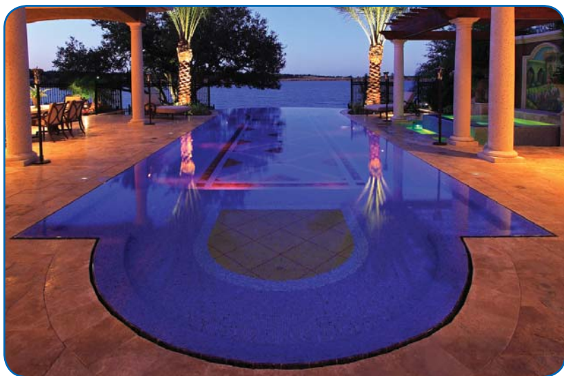
Southern Pool Designs received a Gold Award and the Best of Show Award for this swimming pool. Photos of all Design Award winners will be featured in this newsletter over the next few months as well as posted on www.FloridaPoolPro.com

Tropical Pools and Spas, Maitland Merit Award, (2) Silver Awards, Gold Award