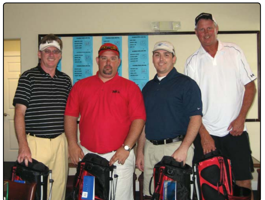
The Golf Tournament's winning team with their new golf bags.