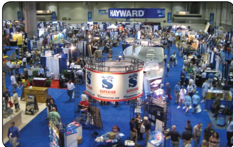
The exhibit halls at the Florida Pool & Spa Show

See you next year on February 20-21, 2009 at the "old" building at the convention center in Orlando.