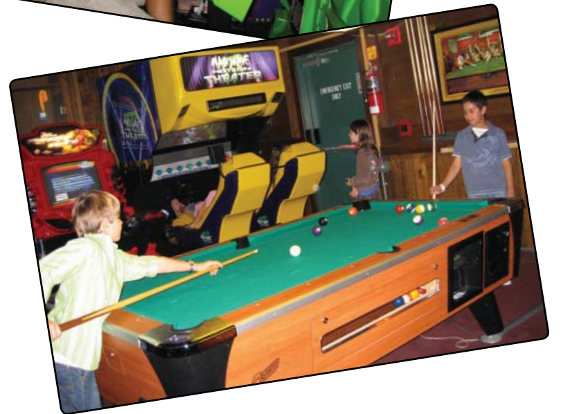
The kids and adults had a great time playing all the games at Friday's Front Row!