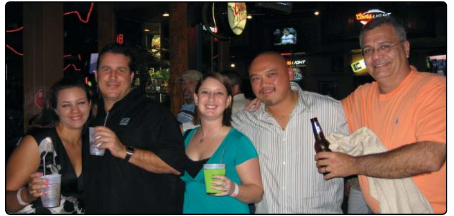
Fun was had by all at Friday's Front Row Pool Industry Party!