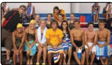
The team from Tampa Preparatory School.