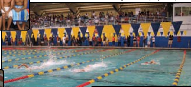
A close race in the girls 100 yd freestyle!