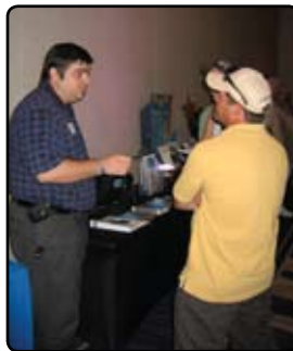
The Tampa Bay Chapter Energy Table Top Event on October 5 was a great success!