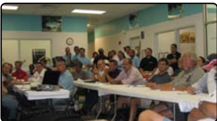
The Broward Chapter's CE course was filled to capacity with standing room taken as well!