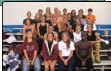
The team from Chiles High School. (right)