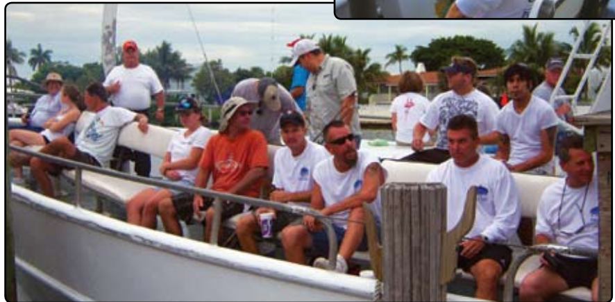
Everyone had a great time at the Broward Chapter Fishin' Mission on August 22. Over 150 fish were caught on the trip!