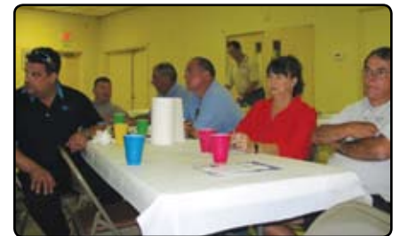
Everyone had a great time at the Polk member appreciation event September 15.