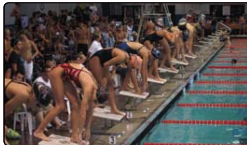
2009 FSPA Swim Meet - a race about to begin!